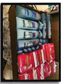
Pictured: Personal Care Items donated to Catholic Charities